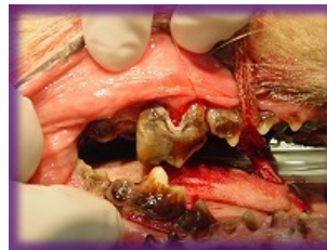
Example of Periodontitis

Gingivitis is a progression of tartar when the gum line colour changes from coral pink to red or purple. Swelling is apparent and plaque and calculus are present above and below the gum line.