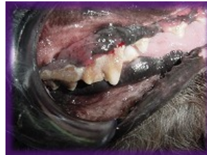
Example of Gingivitis

Gingivitis is a progression of tartar when the gum line colour changes from coral pink to red or purple. Swelling is apparent and plaque and calculus are present above and below the gum line.